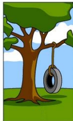
What the customer really needed