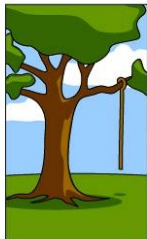
What operations installed