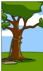
How the Programmer wrote it