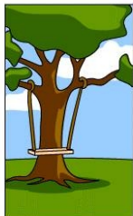
How the Project Leader understood it