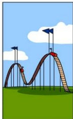
How the customer was billed