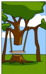
How the Analyst designed it