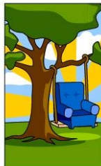
How the Business Consultant described it