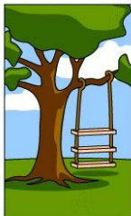
How the customer explained it