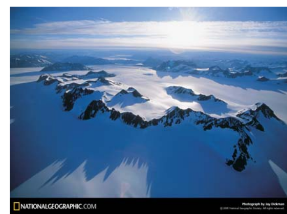
Upper Yukon River Basin, Canada