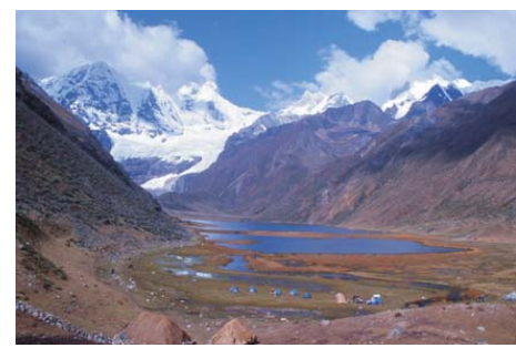
Cordillera Huayhuash, Peru